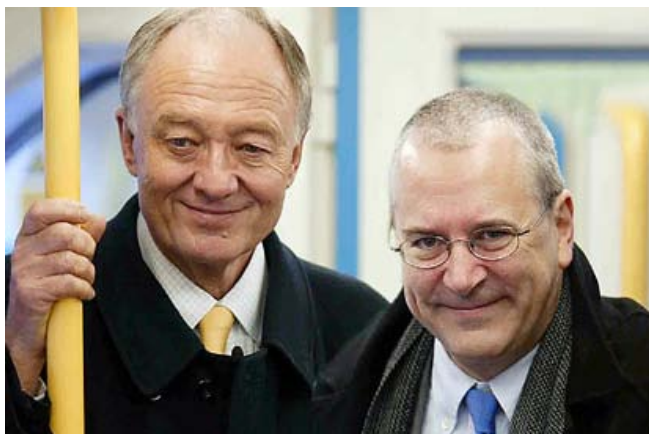
Influencing every Londoner's life: Mayor Ken Livingstone and Transport for London Commissioner Peter Hendy

Sir Ian Blair: Met police commissioner. Rarely out of headlines due to terror threat or ill-judged comments.